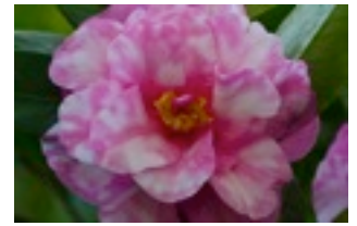
Rose Form Double